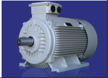
TYPE YD - LOW VOLTAGE (380V) - Cast Iron Frame